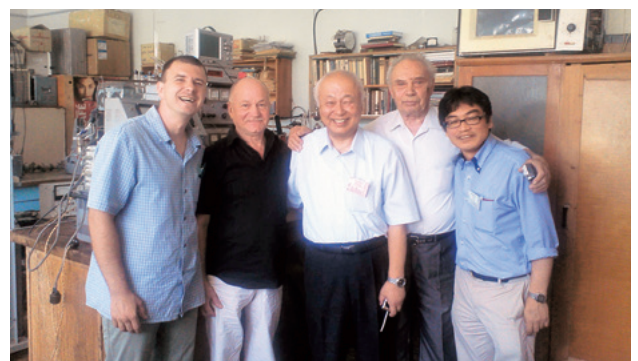
Members of collaboration with Usikov Institute for Radiophysics and Electronics, NASU, Ukraine